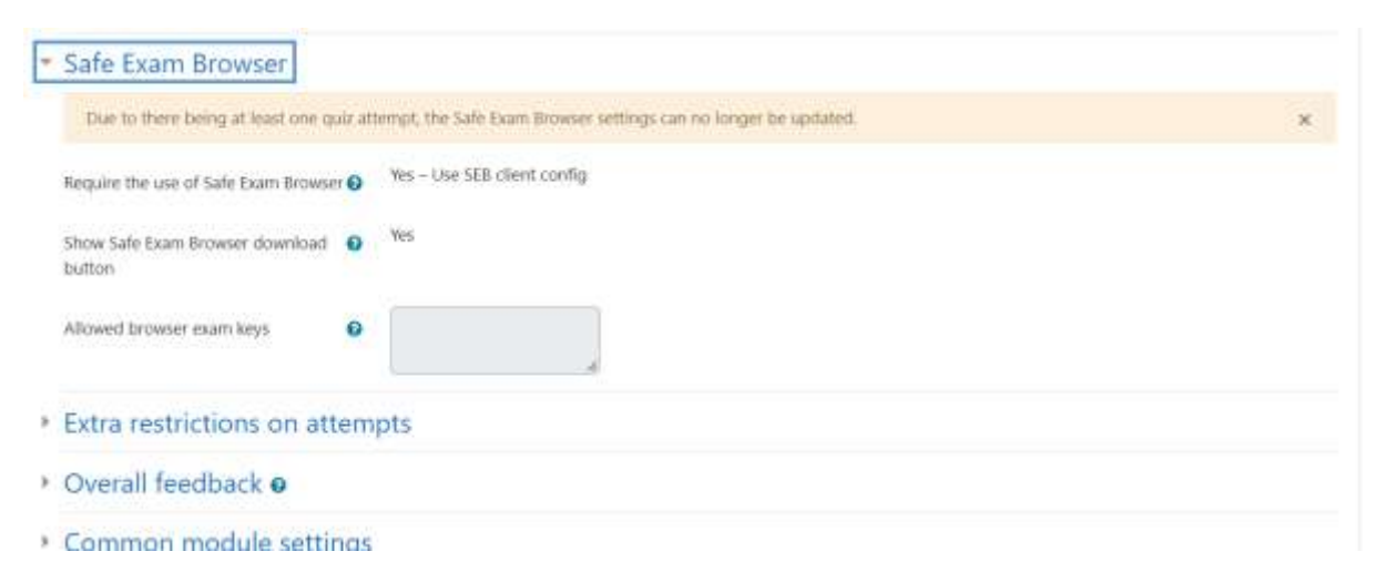
Figure 2. Configuration allows only the use of SEB software to perform the test

The school buys the license of Zoom software Pro version to organize the supervision for the exam rooms. This version allows to decentralize co-host for exam administrators to help control the exam room better.